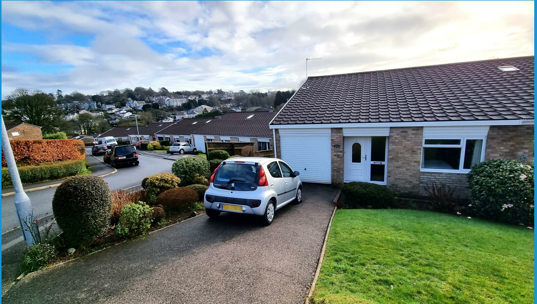
Highfield Park Road Launceston | Cornwall